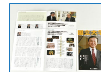
Public relations magazine "National Universities" published