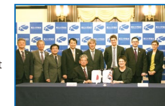
MOU on Exchange signed with Universities UK (UUK)