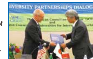
MOU signed with the American Council on Education (ACE)