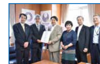
Meeting with Mr. Yoshimasa Hayashi, MEXT Minister

Discussion meeting with editorial writers held (Jul.)