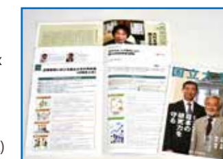
Published the public relations magazine "National Universities"