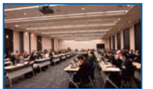
The second Board of Directors meeting