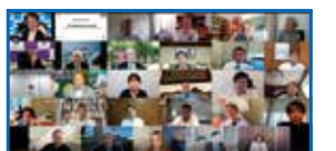
The Japan-UK Higher Education Dialogue 2021