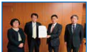
Written request submitted to Mr. SUEMATSU Shinsuke, MEXT Minister