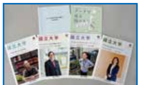
Publication of the National Universities magazine and other reports