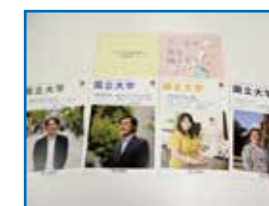
Publication of the National Universities magazine and other reports