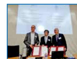
The signing of an agreement between JACUIE, France Universités, and CDEFI