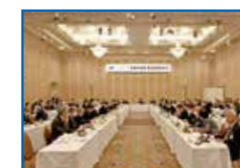
The second Board of Directors meeting