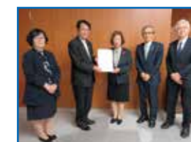
Written request submitted to Ms. NAGAOKA Keiko, MEXT Minister