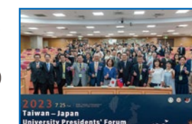
2023 Taiwan-Japan University Presidents' Forum