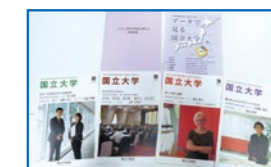
Publication of the National Universities magazine and other reports