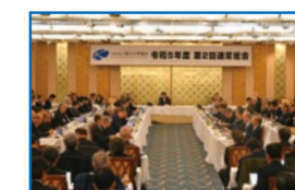
The second Board of Directors meeting